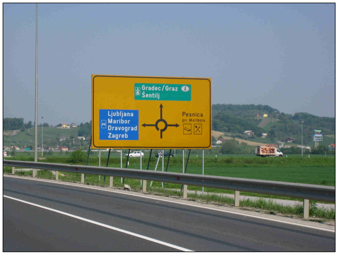
Fig. 5: Slovenian traffic signposts show exonym and endonym

Also in Austrian railway traffic – with station signs, schedules and announcements – only endonyms are used.