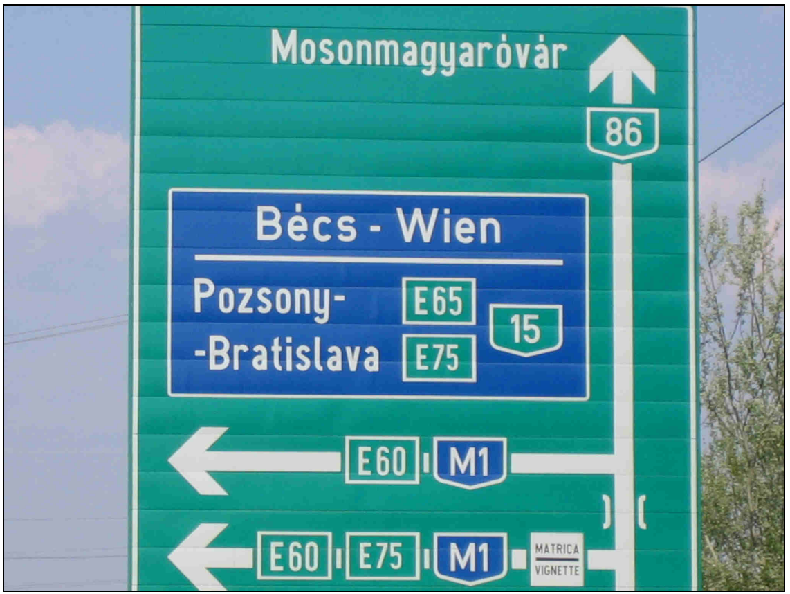
Fig. 4: Hungarian traffic signposts show exonym and endonym

Fig. 3: An exception in Austria: a traffic signpost shows endonym and exonym