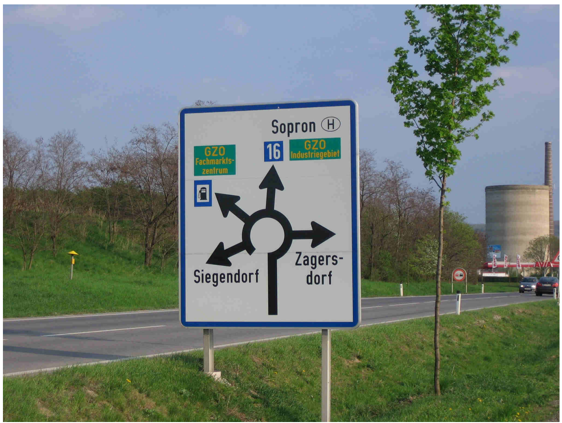
Fig. 2: Even an officially bilingual place in Hungary, Sopron/Ödenburg, is indicated only by its Hungarian name on Austrian traffic signposts